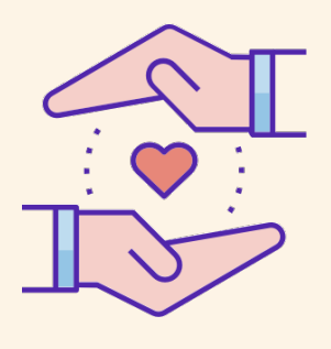
1,458 Home support

More than 1,450 organisations were funded to deliver CHSP services.